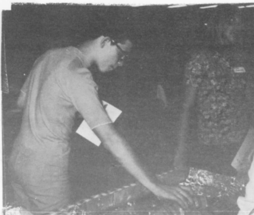
HELP YOURSELF--After a busy morning of speeches and tours, freshmen help themselves to refreshments supplied by Student Council.