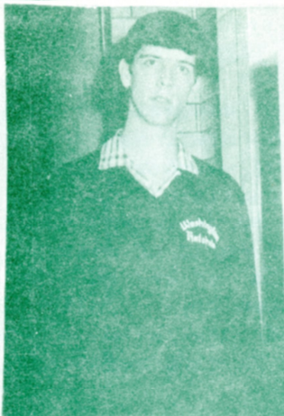
TWO BY TWO by Virginia Elsey

People of wisdom are indeed of strange sort Give them a problem and their faces distort They shut their eyes tight And their fingers take flight With a pencil on anything that happens in sight.