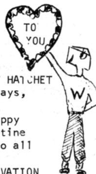
WOODY HATCHET says,

Sentimental feelings tied with the early festival still remain. Exchanging of beautifully decorated cards with cupids and hearts, words of friendship, a sentimental verse, or a message of love rates only a second to the volume of mail sent at Christmas time.