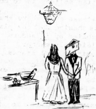
WOODY HATCHET says, "Everybody dance!"

Smoking students will find more prestige and respect from adults and classmates if they devote their time to more healthful activities and give up smoking.