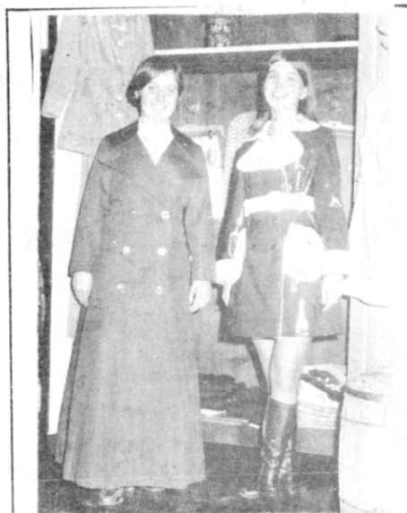
HOW ABOUT THOSE CITY SLICKER LOOKS at THE WARDROBE

A tragedy happened at WHS on Wednesday, February 4. The beloved milkshake machine fell over and one of the legs was badly broken. Due to the serious fall, the machine will have to be replaced. So if you see any undernourished students, it could be that they didn't have their noon milkshake.